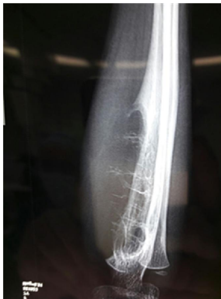
Figure 1. X-ray image showing bone tumor in ulna that destructs the one cortex and fine bony trabeculation the extend to soft tissue.

It should be noted that bone KHE could be misdiagnosed as juvenile hemangioma,