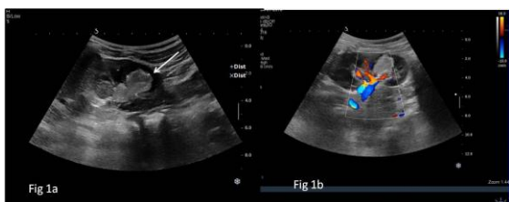
Figure (1a and b). Grey scale and color Doppler ultrasound depicting echogenic mass lesion (arrow) in the lower pole of left kidney. Minimal vascularity is seen on color flow.

showed blooming on GRE images. This led to the suggestion of peripheral calcification or haemorrhage. The mass was showing mild restriction on DW images. In order to resolve the issues of calcification, limited NCCT was performed on a multidetector row CT scanner (Somatom Sensation 40, Siemens, Erlangen, Germany). An amorphous calcification of the mass and peripheral rim of calcification were seen on NCCT (Figures 4a and 4b). The mass was limited to kidney with no evidence of vascular invasion and no evidence of retroperitoneal lymphadenopathy. Right kidney was normal with no evidence of any focal lesion. No evidence of distant metastasis was seen. Ultrasound Guided Biopsy was done which revealed tumor with cells having abundant cytoplasm with moderate atypia and extensive psammomatous calcification. Tumor cells are immunopositive for vimentin and CD 10 negative for HMB 45 and Melan. All these features were consistent with Xp 11.2 translocation associated RCC (Figure 5). Hence, chromosomal studies were advised. Patient underwent left ureteronephrectomy. Post operative period was uneventful. The child came for follow up in OPD and did not have any complaints, so imaging follow-up was not done.