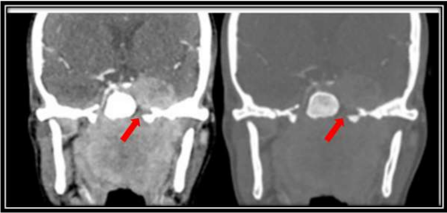
Figure 1.Nasopharyngeal carcinoma: cerebral scan showing an intracranial invasion in a 10-year-old boy.

n: number of failures; N: number of patients; Ref. : reference group; RT: radiotherapy CT: chemotherapy; ITF: infratemporal fossa; CI: confidence interval, HR b : Hazard Ratio brut; HR a : Hazard Ratio adjusted.