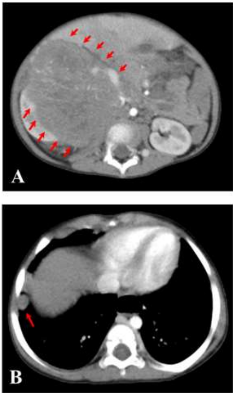
Figure 1. Axial CT Scan of the chest and abdomen without contrast-enhanced. (A): Right heterogeneous enhancing mass lesion with extension to the kidney at the same side, that had crossed mid-line with no obvious calcification. (B): Two nodules with a diameter of 12 mm in right lung showing secondary pulmonary metastatic lesions of mass.

of clinical manifestations of the patient, CT scan was again conducted that the mass size had been reduced to 98×6 mm, but vascular encasement and compressive effect on adjacent organs could still be observed. The patient was transferred to the operation room for the second time for mass resection, but due to inferior vena cava (IVC) invasion, there wasn't the possibility of complete removal of the mass. So, the patient was admitted to the hospital for further chemotherapy and is currently continuing chemotherapy.