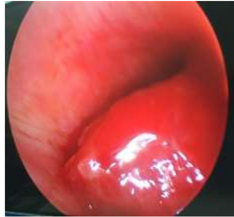
Figure.2. An intraluminal mass was observed in the proximal bronchus intermedius in Bronchoscopy.