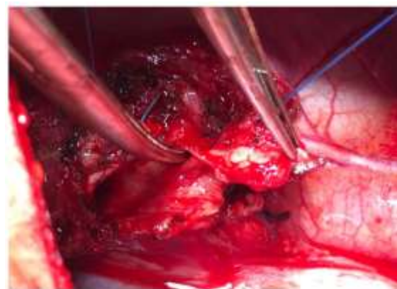
Figure.4. Middle lobe lobectomy was done due to intermedius bronchus involvement.