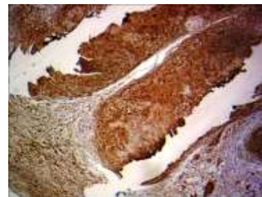
Figure 3. Pathology report indicated the presence of a low-grade spindle cell, Antoni A and B areas, and diffusely positive for S-100 protein.