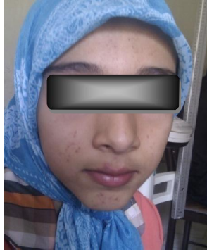
Figure1. Acne on the face of the patient