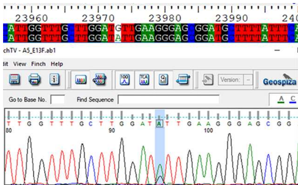
Figure 3: SNP rs6500452 chromatograms, showing forward primers amplification Intron 12 region, against normal FANCA gene sequence